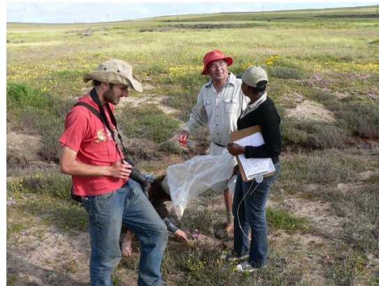
Figure 2. Custodians of Rare and Endangered Wildflowers (CREW) searching for plant species, South Africa.

Information collected by custodians (Fig. 2) has helped to prioritise species that are in need of conservation attention by playing a vital role in the determination of a species red list status. Custodians have played key roles in extending the known range, in identification and in rediscovery of species, particularly those that have not been seen in the wild for decades (Tables 1 and 2). One such example is that of the flower Wurmbea capensis , rediscovered in 2004, having previously been collected only in 1932. As of 2007 there are 12 such ‘rediscovered’ species. Often, findings have also led to new research, for example, field observation of populations of the very rare terrestrial orchid Corycium microglossum , has led to investigations regarding the survival of its pollinators.